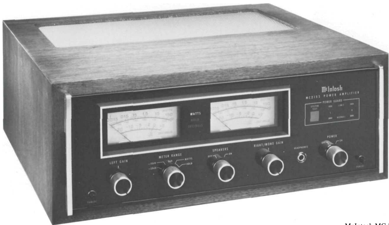
McIntosh MC 2155 150 Watt Per Channel Power Amplifier Optional Walnut Veneer Cabinet